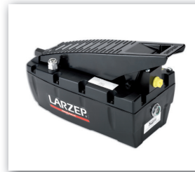
Air Hydraulic Pumps, Z, ZR.