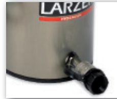
Coupler 3/8"-18 NPT included.