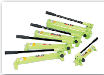
Single Acting Hand Pumps, W.