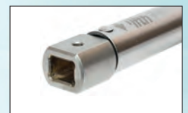
Female Torque Handle (TTfth)

*lbf.in N.m only and lbf.ft only versions are available, contact Norbar for details.