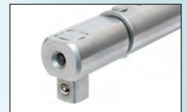
Fixed Head (TTf)

*lbf.in N.m only and lbf.ft only versions are available, contact Norbar for details.