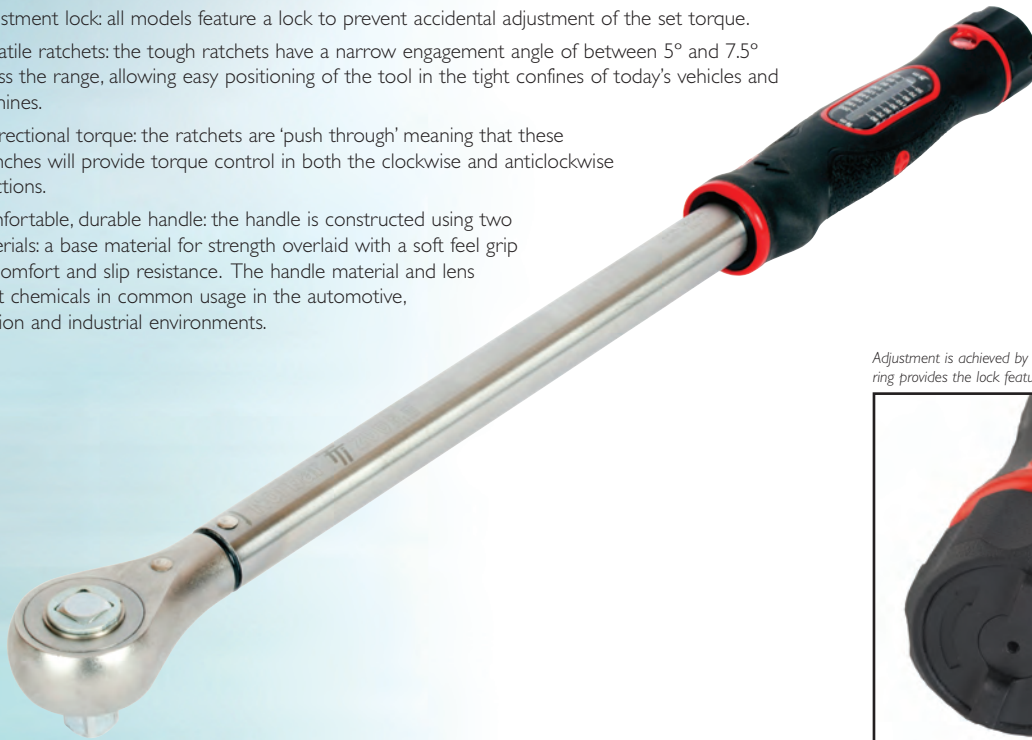
Adjustment is achieved by rotating the end knob. The centre ring provides the lock feature.