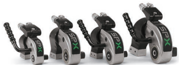
To be used with torque wrenches, pages 11-33